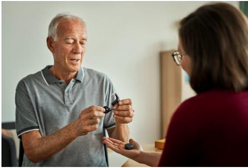
Image description: A man is holding a brown Cochlear Implant in his hand. He is talking to a lady and looking at the Implant.

You may also decide to wait a little longer before making your decision. The Cochlear Implant team aim to provide you with all the information you need to make the right decision for you, at the right time for you. Please note in order to be eligible for an NHS-funded cochlear implant you have to meet certain eligibility criteria as set by The National Institute for Health and Care Excellence (NICE), last