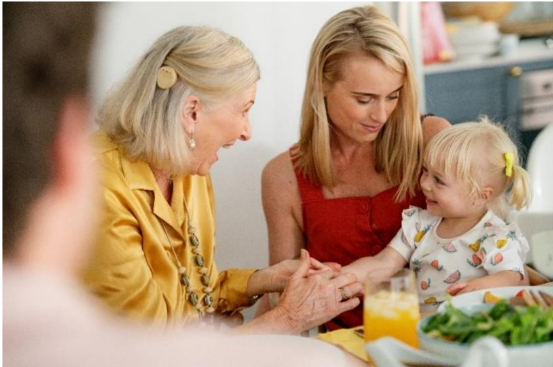
Image description: An older lady is talking to a young child who is sat on another lady's knee. The lady has a pale-yellow Cochlear Implant that matches her blonde hair. They are smiling and laughing.