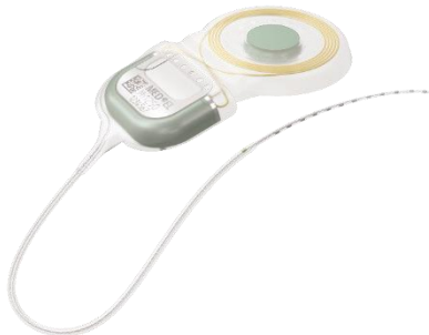
Image description: A photo of the internal implant shows a tiny thin electrode that is placed inside the inner ear and a small magnet that sits under the skin.

The implant part must be surgically implanted during an operation. It includes a receiver with a magnet in the middle that sits just under the skin behind and above your ear, and a string of tiny electrodes which are placed very gently inside the cochlea (inner ear). The magnet holds the external coil securely in place directly over the implanted receiver. The receiver picks up the signal from the transmitter coil on the outside of the skin and sends it to the electrodes inside the cochlea. The electrodes take over the job of the damaged hair cells in the cochlea and send electrical signals along the nerve of hearing to your brain. Your brain learns to recognise these signals as sounds and speech with time and regular practice.