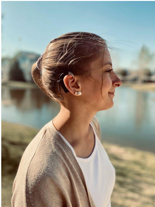
Image description: a young woman smiling. She has a dark brown Cochlear implant that matches her hair.

If you became deaf after you developed spoken language skills, then a cochlear implant might be suitable. The Cochlear Implant team will be able to advise you further based on your history. The better and the more recently you have had good hearing, the better the outcome with a cochlear implant will be.