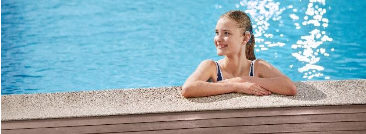
Image description: A girl with wet hair is sat in a swimming pool while wearing her Cochlear Implant.

Having a cochlear implant should not restrict daily activities at all for most people. Taking part in most sports is fine, but you may be advised to avoid certain high-risk contact sports where impact to the implant is possible (e.g. boxing) and participation in extreme sports such as skydiving should be avoided due to risk of damaging the implant. You can swim as normal and SCUBA diving is allowed down to 25 metres. Traveling in an aeroplane is also fine. You will need to inform your doctor if you need to have an MRI scan as the implant is metal and correct precautions need to be taken. Most implants nowadays are MR compatible and thus you can undergo this investigation with an implant. If you have specific concerns you can discuss these with the Cochlear Implant team during your assessment.