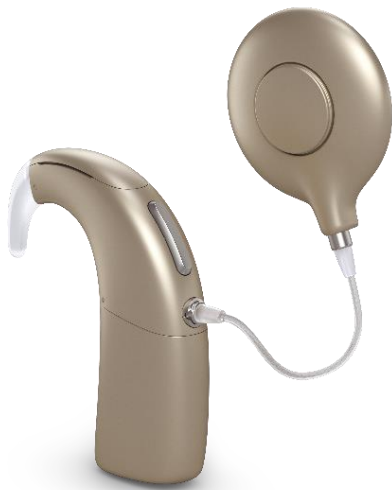
Image description: a photo of a speech processor showing it has 2 parts: a device that looks like a hearing aid sits behind the ear and a round smooth transmitter is placed behind and above the ear.

The external part looks a little like a hearing aid. It has microphones to pick up sounds around you. It passes these sounds to a tiny computer processor that converts them to electronic signals. The signals are then sent to the transmitter coil (circular part) that is placed flat against the skin slightly behind and above your ear. The coil transmits the signal to the internal implant using a radio signal. The device is powered by batteries which you need to change twice a week or recharged daily.