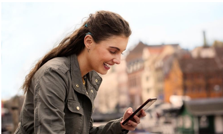
Image description: Photo of a young woman sat outside looking at her mobile phone smiling. She has a blue Cochlear Implant on her right ear. She has long brown hair.