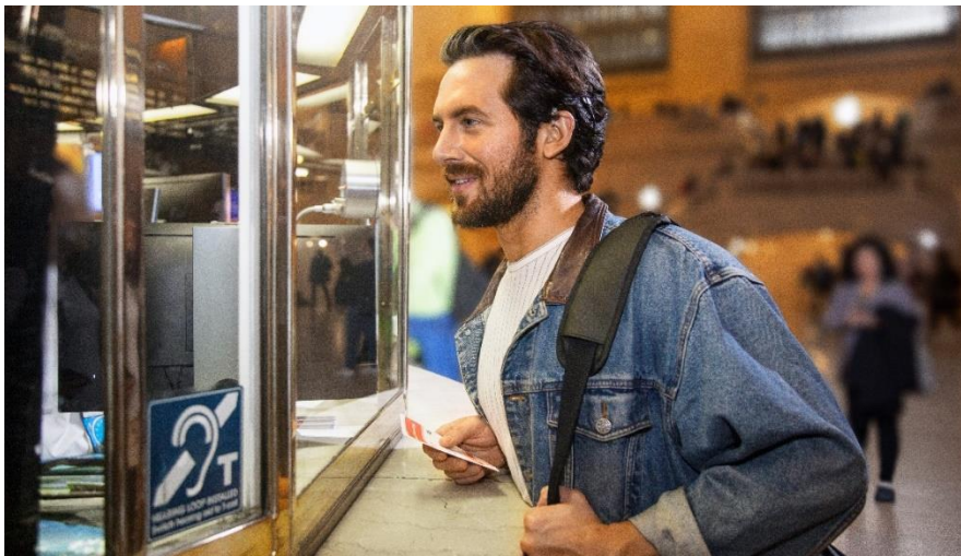
Image description: a man is at a train station asking for information. He had a black Cochlear Implant that matches his hair. He is using a Telecoil loop system to talk to the person sitting behind a glass screen.

This is quite a difficult question to answer as no two people with a cochlear implant gain the same benefit. Benefit from a cochlear implant depends on many factors including duration of your deafness, cause of deafness, and use of hearing aids, but it is still not possible to predict your benefit from these factors. The main reported benefits are: