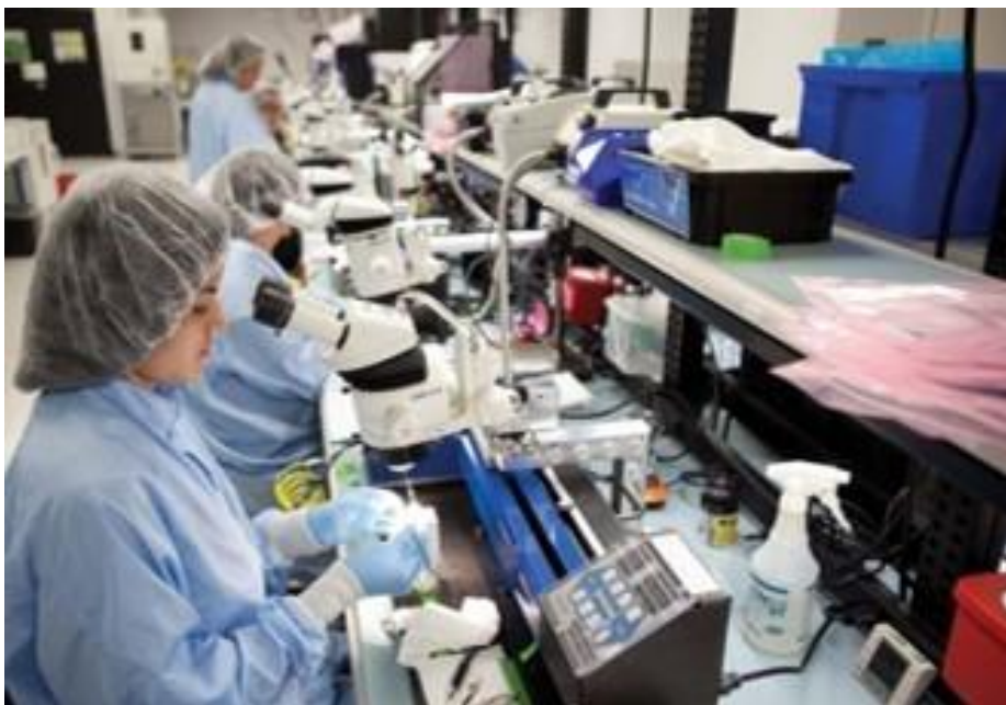
Image description: adults working in a laboratory testing Cochlear Implant components. They are wearing gloves, a hair net and a uniform. They have microscopes and lots of other medical testing equipment around them.

Cochlear implants are very reliable devices. The chance of the surgically implanted part of the implant failing is very low (much less than 1%) and many implant users today have been using their implants for over 30 years without any problems. If it did fail at any time in the future the implant can be replaced through another operation and the outcome tends to be similar to the first operation. The external speech processor that sits behind your ear can be replaced easily if any faults develop, but with some basic maintenance, they are also very reliable