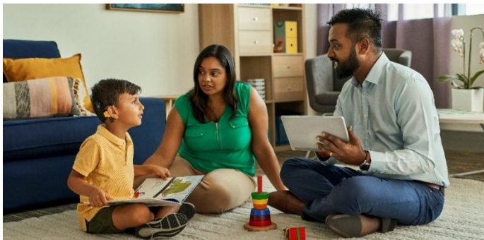
Image description: a young boy sat on the floor with two adults. They are reading and talking.

No. A cochlear implant may be suitable if you have a severe to profound sensorineural deafness in both ears, and you find that hearing aids do not help you very much. As a rough guide, if you cannot follow telephone conversations fluently using your