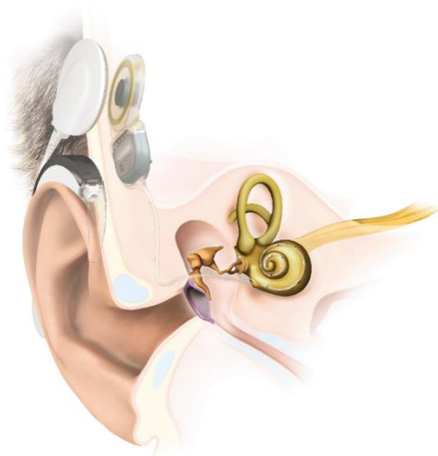
Image description: a drawing showing each part of the ear; outer, middle and inner. A Cochlear Implant is shown with the electrode inserted into the inner ear and the speech processor sitting on the outer ear.

Cochlear implants give a sensation of hearing and may provide better hearing than hearing aids if you are severe to or profoundly deaf and meet the national candidacy criteria. A cochlear implant is an electronic device that has two parts: the internal ‘implant’ and the external ‘speech processor’. The system works in a completely different way to a hearing aid. It does not make sounds louder but converts sound to electricity that travels along your hearing nerve and is recognized in your brain as sound.