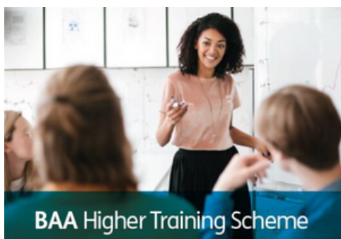
BAA Higher Training Scheme

The Higher Training Scheme (HTS) is a modular, in-service programme that builds on your existing audiology skills; ideal for those that want to become an advanced practitioner or work in specialist clinical areas such as paediatrics, balance, therapy or tinnitus counselling.